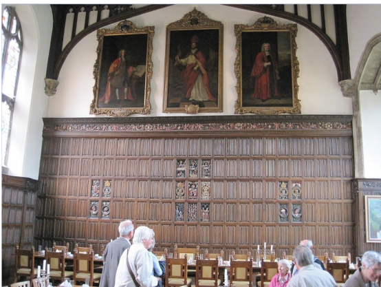
Linenfold panelling at Magdalen College