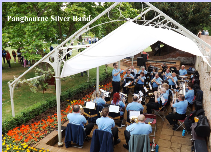
Pangbourne Silver Band