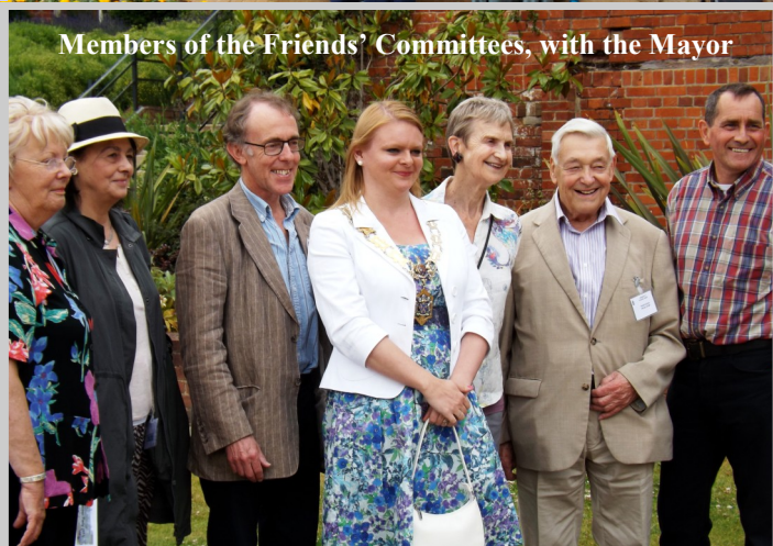
Members of the Friends' Committees, with the Mayor