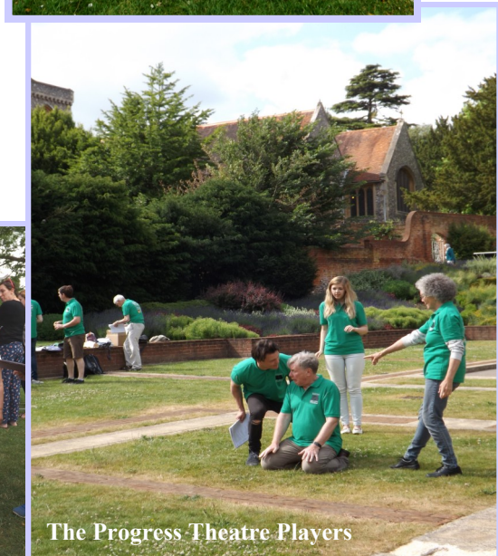
The Progress Theatre Players