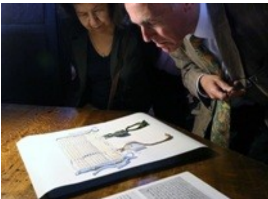
Viewing the Great Seal at Balliol College