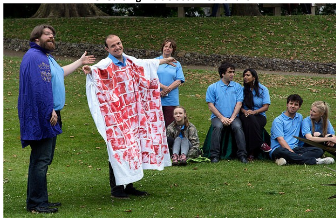
Progress Theatre Players