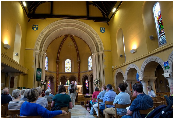
Rehearsing inside St James' Church