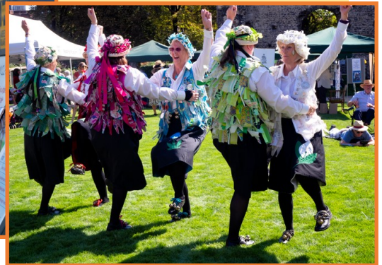
Shinfield Shambles Morris Dancers