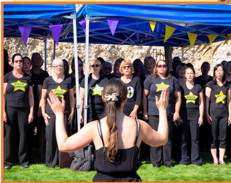
The Rock Choir

(More photos are on our Website and Facebook pages)