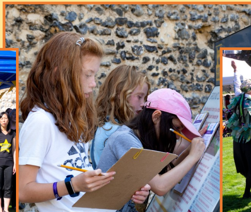
Searching for answers on The History Trail