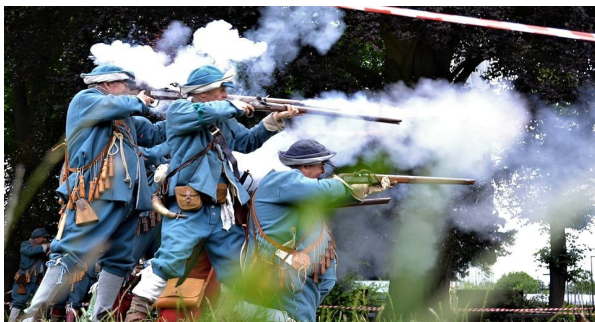
Earl Rivers Regiment of Foote in Action

Some historic figures and below, crowds in the Dormitory Area