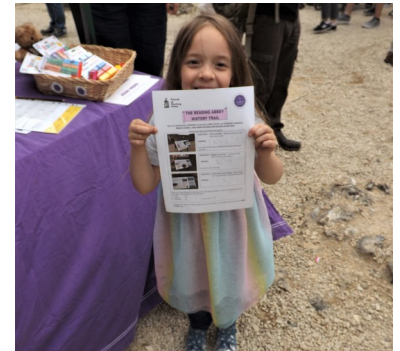
Above and below - some budding historians