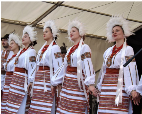
Above: Some of the Prolisok Ukrainian Dance Troupe