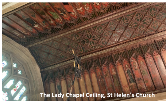
The Lady Chapel Ceiling, St Helen's Church