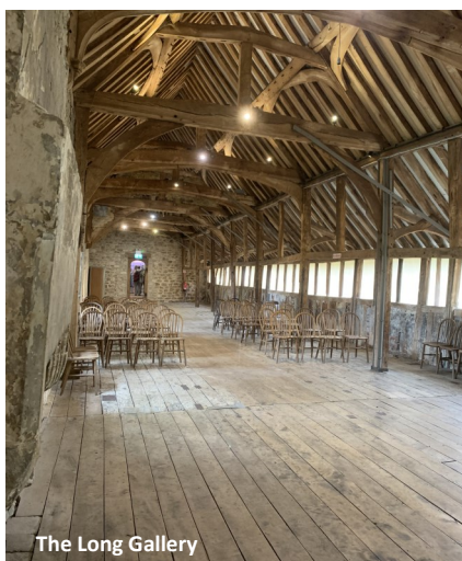
The Long Gallery