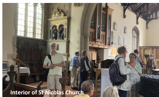
Interior of St Nicolas Church