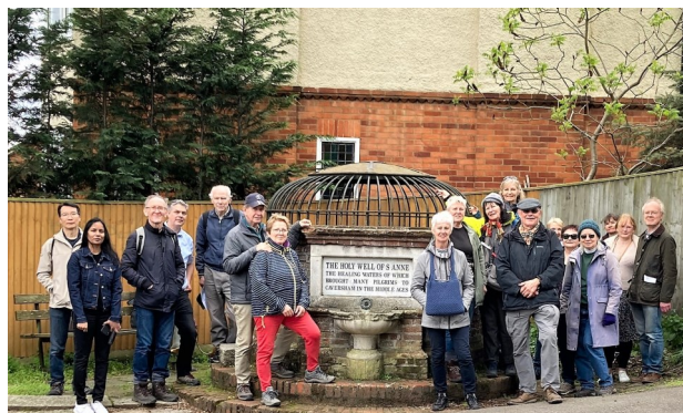
Reading and Caversham Pilgrimage Sites St Anne's Well, Caversham, 12 May.

The Friends of Reading Abbey were pleased to be involved and provided two walks – Reading and Caversham Pilgrimage Sites and a Tour of the Abbey Quarter , both led by committee members. All places were taken on both. Having received positive feedback, REDA plan to run the festival again in May 2024, over a longer period, dates to be confirmed. By following the link Readingwalksfestival.org you will find a short report on the 2023 festival, plus many more photographs.