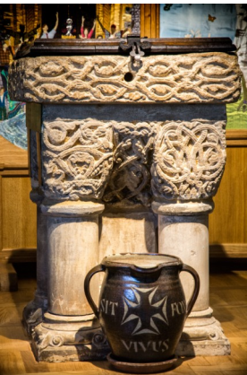
The Abbey Stone