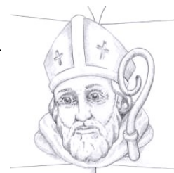
Image of the last Abbot